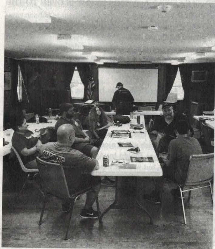
Hunter Education Class in June