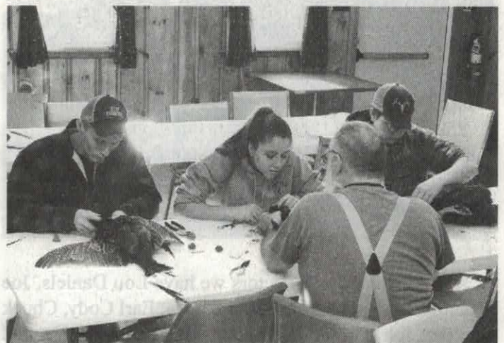
The next generation Taxidermists