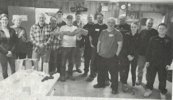
Gun Shot Wound (GSW) Trauma and CPR/First Aid/AED class