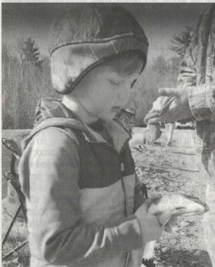
Successful fish derby day at Norco