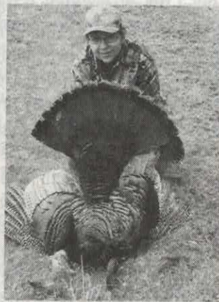
Mary's bird 19 lbs , 3/4" spurs 14 1/4" beard!