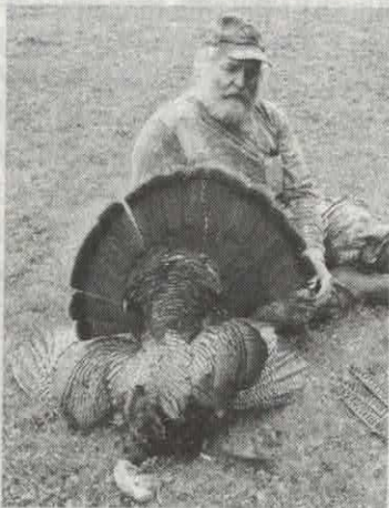
Duffy's bird 17 lbs, 3/4" spurs, 10 1/4" beard

The joy's of hunting together!! The Lanciani's