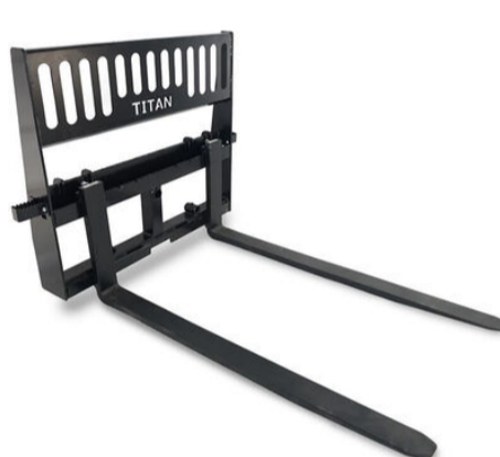
Titan 60" Pallet Fork Attachment Skid Steer Universal HD Pro Duty Tractor Loader