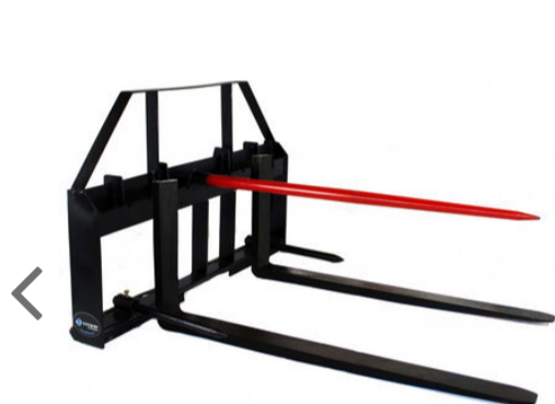
FRLD Frame With Optional Spears And Pallet Forks