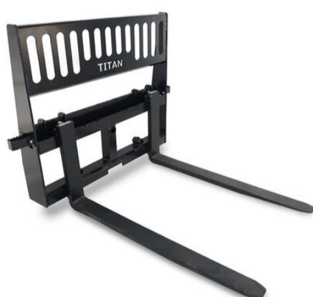
Titan 42" Pallet Fork Attachment Skid Steer Universal HD Pro Duty Tractor Loader