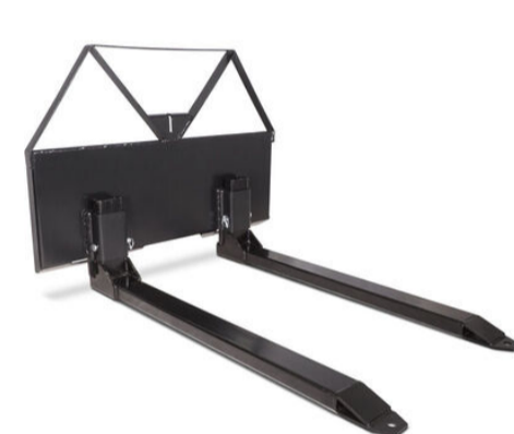
Titan 46" Pallet Fork Attachment Skid Steer Quick Tach Mount 2600 Lb Capacity