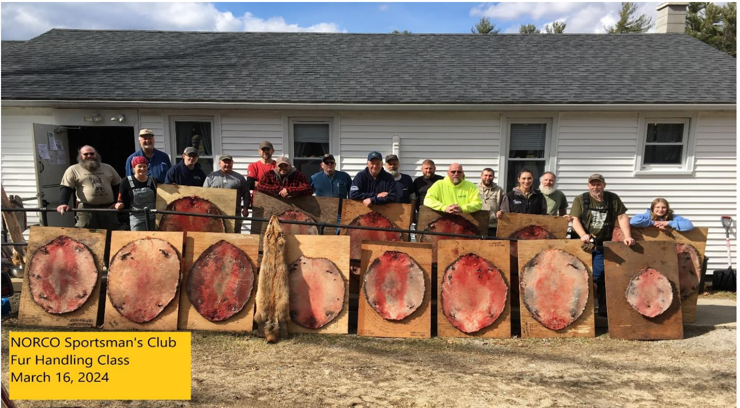
NORCO Sportsman's Club Fur Handling Class March 16, 2024